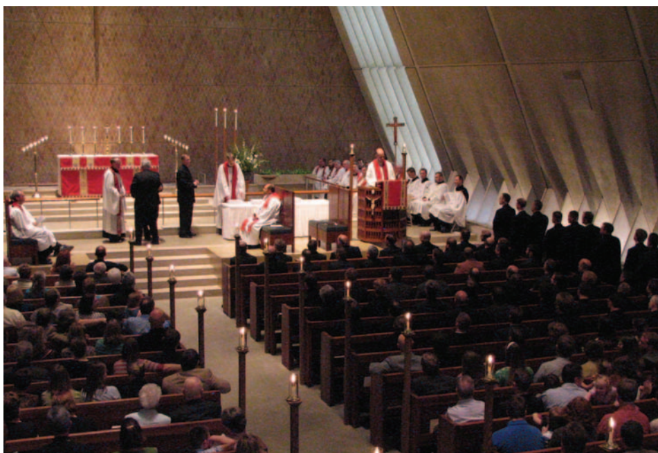
Call day, such as this service at Concordia Theological Seminary, Fort Wayne, is the culmination of the process of pastoral education. Technology is bringing many new dimensions to the formation process.